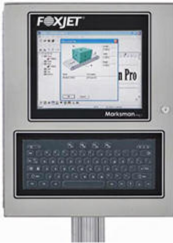
Marksman Pro Controller

A manufacturer of Natural, Organic and Kosher food products located in Connecticut had been hand-labeling their case packs and products. With the manufacturer's continued growth this method was slowing the packaging process, increasing operating costs, and more importantly affecting the company's ability to grow. The manufacturer invited the Northeast Sales Team to visit their manufacturing and packaging facility to review their processes. Following the site evaluation, the Northeast Sales and Service team went to work on a solution to automate the identification process. The specialists at IDT returned with an automated product identification system that would accommodate the current 12 labeling lines. The new system was comprised of two parts: one for material handling and one for product identification. Ten IDT Model 250 Printer Applicators were affixed to five integrated conveyors to automate the material handling and variable information labeling portion of the line. While 12 Foxjet High Resolution Inkjet systems, each comprised of a Marksman Pro Controller and Pro Series 768 Printhead, applies marks to case packs. Because the majority of this customer's labor force does not speak English, IDT developed a scan board to scan variable information into Marksman Pro Box Writer. This scanned code is accessed in the networked database file and this populates the message to be printed on the