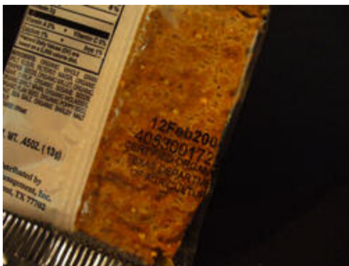
Overprinting on Cracker Wrapper

A manufacturer of cracker products distributed in high-end retail stores needed a coding solution to imprint "use-by-dates" on single-serve and multi-pack packages. The customer's production line, which packages 12 different SKU's, uses a horizontal wrap to wrap single-serve and multi-pack packages for three retailers. In their initial investigation, the manufacturer was considering using hot stamp technology. However, based on previous experience with ID Technology, the customer called in the Specialists from IDT to review their needs and recommend a solution. The Specialists at ID Technology went to work analyzing the production environment, the customer's current needs, as well as their tire coding process and requirements. During the evaluation the IDT team identified an opportunity to increase the efficiency of the customer's tire coding system. By deploying an IDT Thermal Transfer